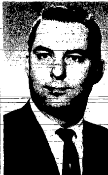
A social hour will precede the buffet supper at 6:30 p.m.