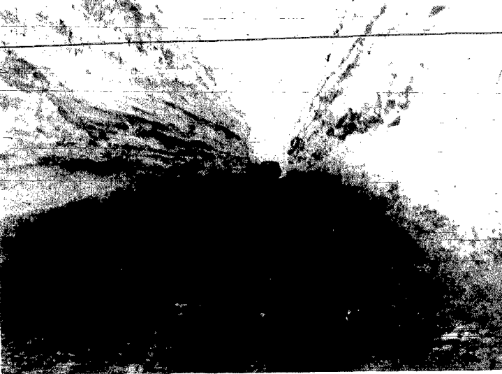
NORTHEAST NEBRASKANS were prone to complain about the weather this week as seven inches of new snow was driven by 40-mile-per-hour winds into road-blocking drifts that brought most highway travel to a standstill. Things could be worse, however. Mute testimony to this fact is the photo above, taken in January, 1949 when 14-foot drifts blocked the old Carroll highway three miles north of Wayne. Traffic around Wayne was returning to near normal Wednesday as highway crews cleared the main traveled roads. Rural roads were still completely blocked in some areas and crews were working almost around the clock to open them for travel. Thursday's and Friday's snow brought the accumulated snow on the ground in Wayne to 10 inches.

No Complaints, Please. Things Could Be Worse!!